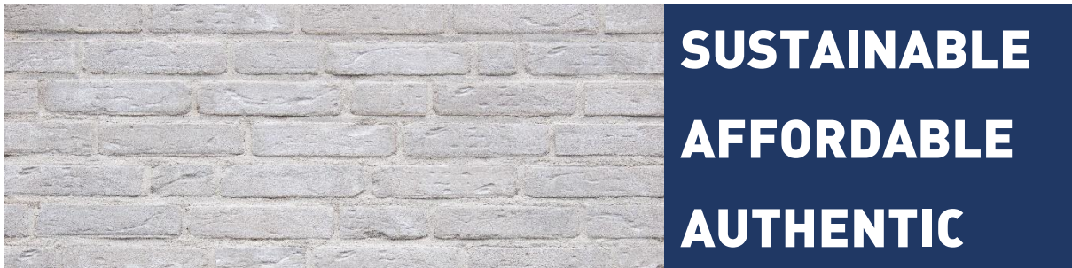
Photo 1 Lowie Rustique White WF HV

Although we are surrounded by millions of bricks every day, most of us don't think about bricks too often. For thousands of years, clay bricks have not changed and for a long time it seemed that they never would. However, everything changes and so do clay fired bricks. The fact is that the traditional energy-intensive furnacing process at high temperatures is simply not sustainable. Only a radical shift in the production method can preserve the classic brick we all appreciate.