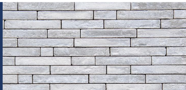
Photo 2 Lowie Design White Grey HV HF

“We believe that real ecological progress is only possible if it is also affordable”